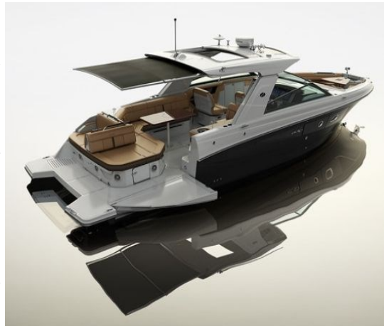
The Sea Ray SLX 400 is produced at the Tellico Plant in Vonore.

Products based on factors including innovation, impact on the industry, and how each product advanced its category. With its incredible wake-shaping capabilities, unique V-hull, patent-pending wake surf fins, and Mercury® Marine V-drive engine, the SLX-W 230 is a game-changer, as well as a remarkably versatile, family-friendly addition to the sport boat market.