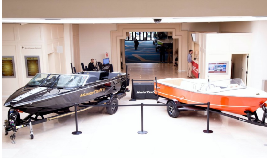
The first boat ever built on the right, and the 50th anniversary ProStar on the left.

MasterCraft is by far the largest producer of inboard ski, wakeboard and luxury performance powerboats in the world. It sells boats in over 30 different countries and has over 130 domestic and international dealers. Every MasterCraft comes from Vonore and hundreds of owners, skiers and boarders visit the company's headquarters every year to see the birthplace of their most prized possession.